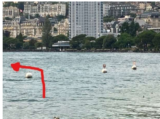
A buoy in front of Freddy Mercury